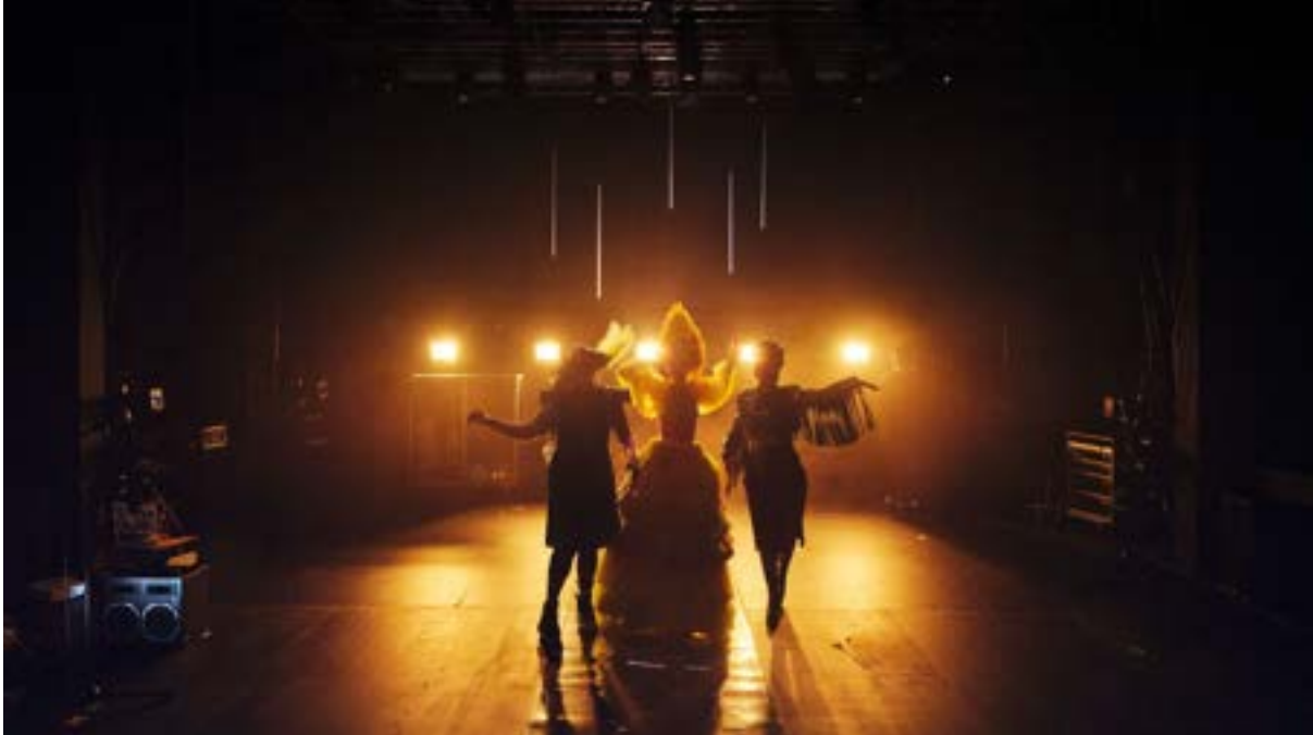
Production shot of The Wrens by Ros Kavanagh