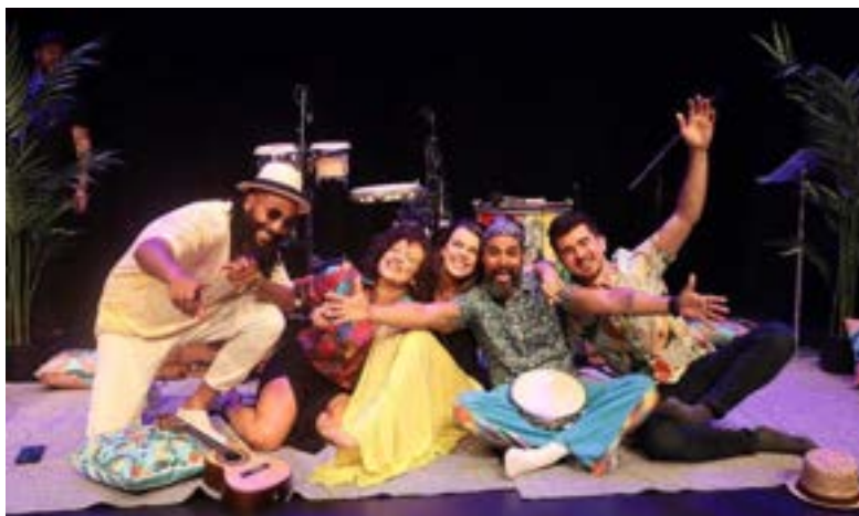
Ta TumTum! on the Riverbank stage

Riverbank Arts Centre is a producer and co producer of new work. We work closely with visual artists and theatre artists to develop and present work, with a particular focus on arts experiences for young people. We commission exhibitions, host residencies and have presented world premieres of work by leading theatre companies including Theatre Lovett, Monkeyshine, Moonfish, Fidget Feet Aerial Dance Company, Branar Téatar do Pháistí, Collapsing Horse, and Super Paua.